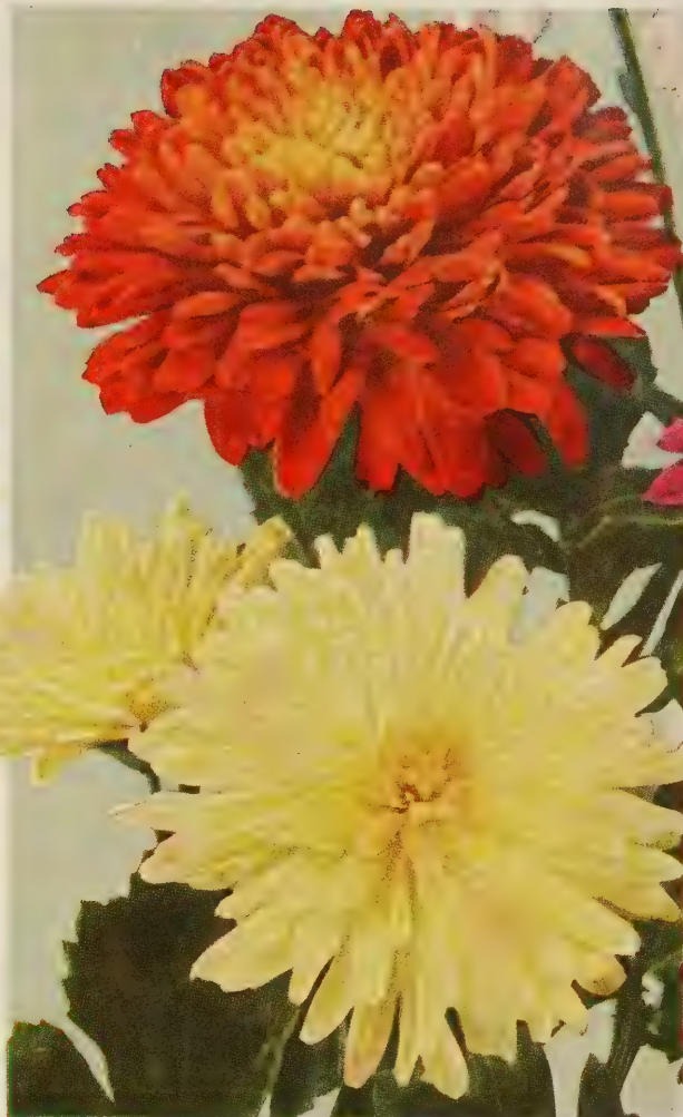
MEDITATION (Bronze) Top CANARY (Yellow) Bottom 60c each; 3 for $1.50